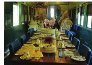
Lunch is always a highlight